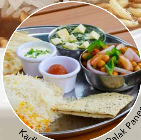
Kadhai Aloo Chole & Palak Paneer