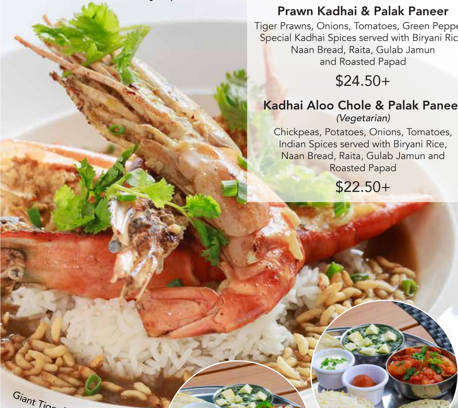
Giant Tiger Prawn Pao Fan