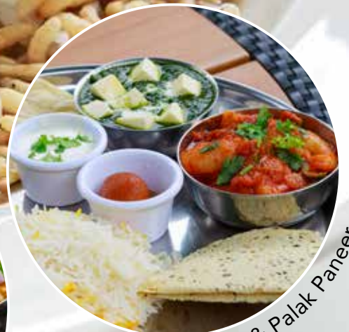
Prawn Kadhai & Palak Paneer